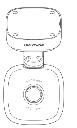
Dashcam • F6 User Manual